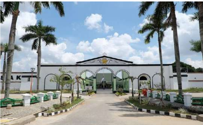
Kuto Besak Fortress