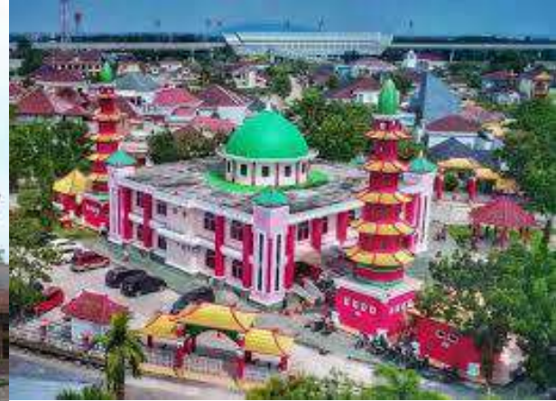
Cheng Ho Mosque