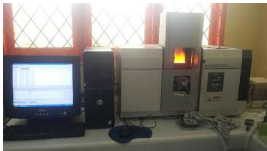
Atomic Adsorption Spectrophotometer