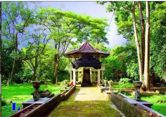
Siguntang Royal Tomb Park