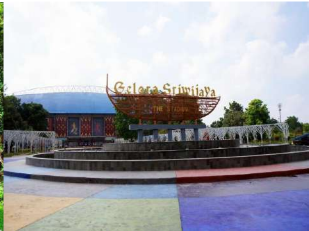
Gelora Sriwijaya Stadium