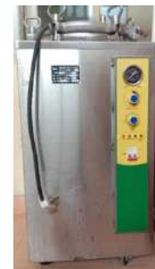
Pressure Steam Sterilizer