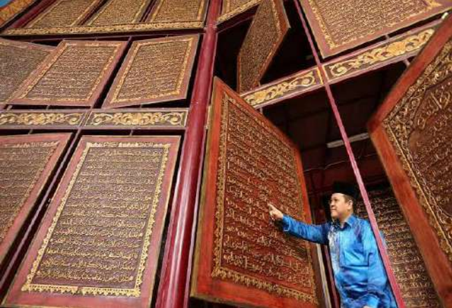
Bayt Al-Qur'an Museum