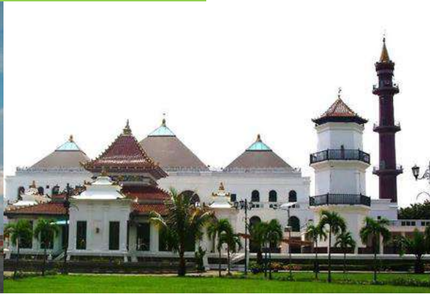
Sultan Mahmud Badaruddin Holy Mosque