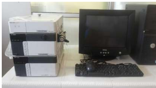
High-Performance Liquid Chromatography