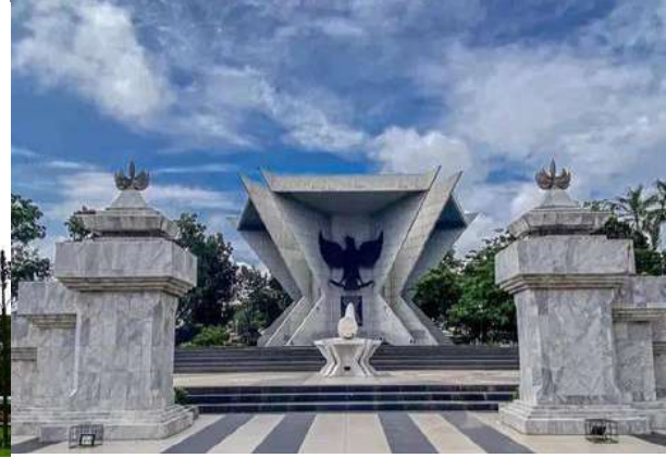
Historical Monument "Monpera"