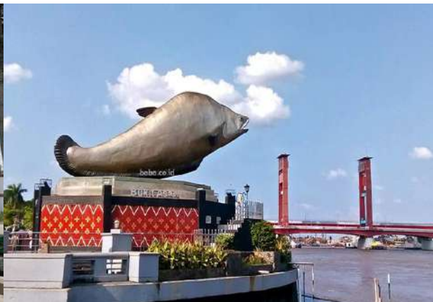
Iwak Belido Statue