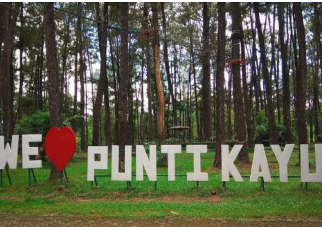
Punti Kayu Forest Tourism